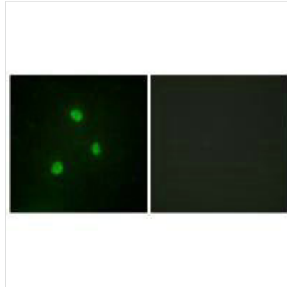
Immunofluorescence analysis of A549 cells, using TBX1 antibody.